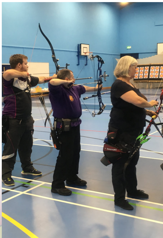
Some of 2017's L&R archers training with the Regional Senior Squad.