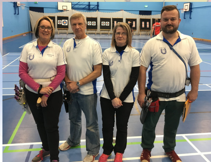
2018's archers attending the Regional Senior Squad meeting at J Whittaker School, Mansfield.